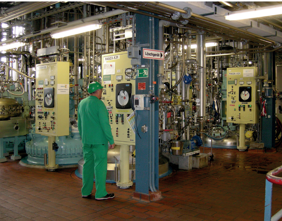
Multipurpose building WSH-2060, approx. 2012

Yes, actually, because a lot was changing and we didn't know in which direction our journey would be going. For example, mine went in the direction of pharmaceuticals, in the newly converted WSH-2084, in which Diovan® would be