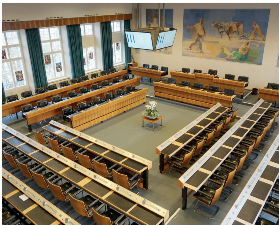
Cantonal Chancellery Basel-Landschaft