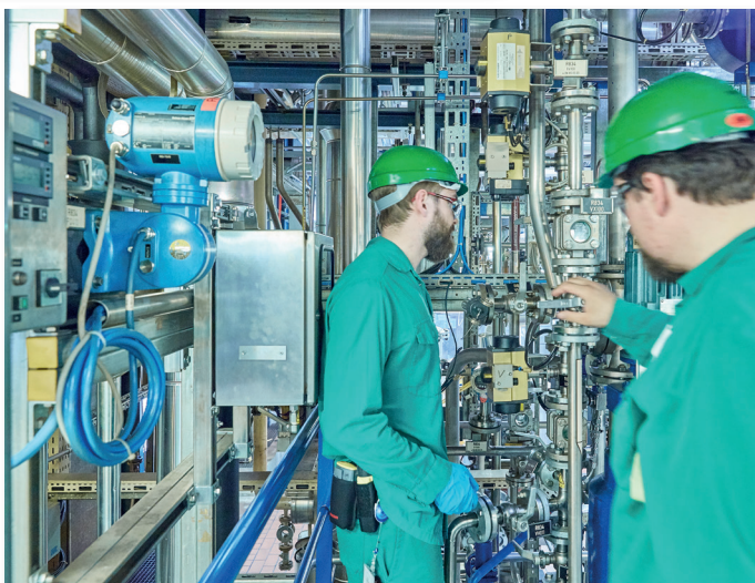
Small scale production WSH-2112, 2015

Thank you for your story, and all the best for the future!