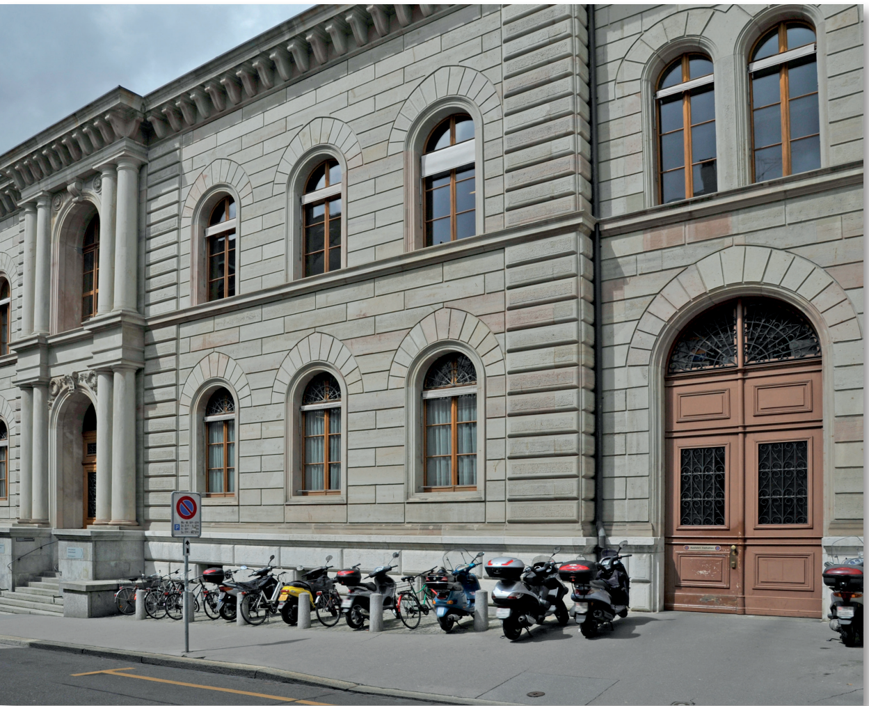
Basel-Stadt Civil Court